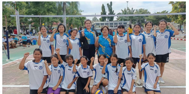
The winning girls Volleyball team at a high school in Mukdahan province