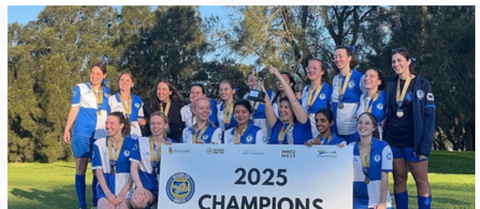
All Age Women Division 5B