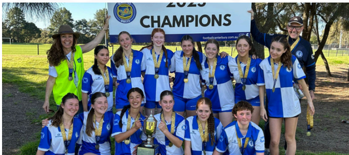
Under 16 Girls Division 2