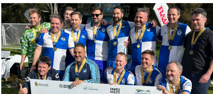
Over 35 Division 6