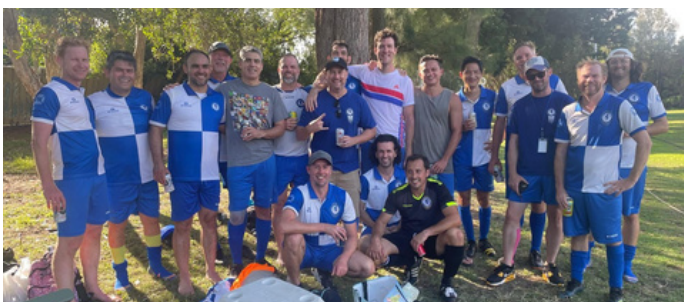
Over 35 Division 5