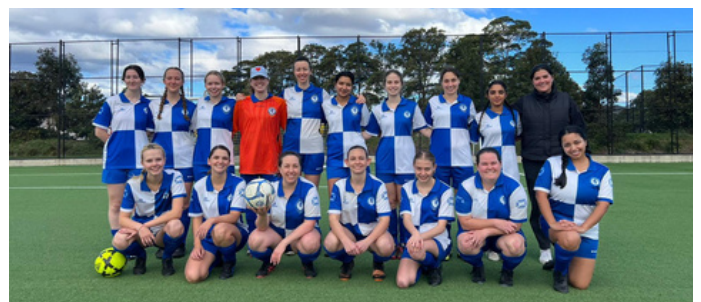
All Age Women Division 5B

We acknowledge the traditional custodians of the lands on which we meet, train and play