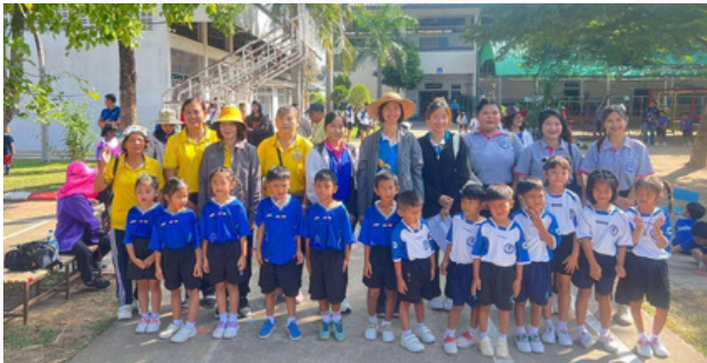
Junior competitors in Baan Lak Roi