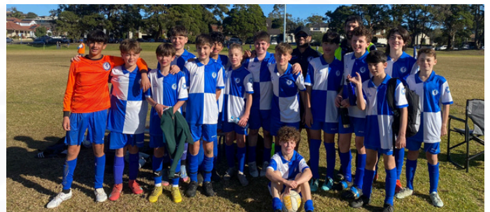
Under 13 Division 3