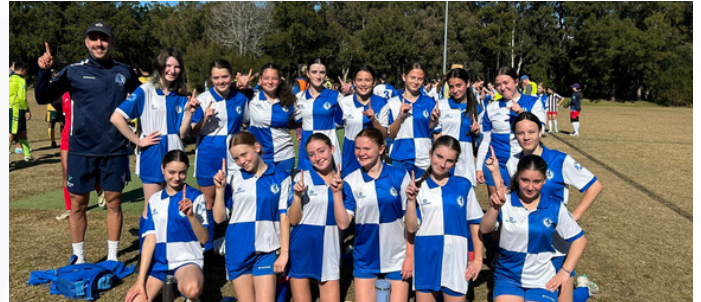
Under 14 Girls Division 2