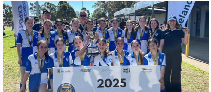
Under 15 Girls Division 1