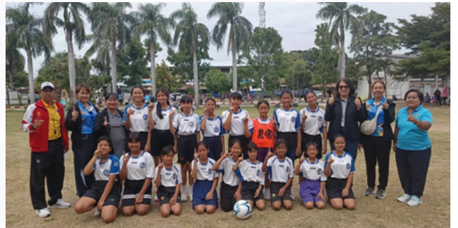
A girls soccer team at a high school in Phitsanaluk province.