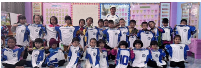
The kindly class of Baan Pon Tong nursery school in Chaiyaphum province. That's our nephew and his mum marked at the back. His nickname? Kick!

A few years ago, we came up with the idea to distribute football and sports equipment to schools in the far North East of Thailand where Wan comes from (Khonkaen/ Koraat area). We begged quite a few old balls and training bibs in good condition from Hurlo, deflated the balls, packed them in our bags and headed to Thailand. We used our own money to buy some volleyballs, table tennis bats, balls and nets, and made up about a dozen packages. We tend to travel a lot in remote areas up in the North East, way off the western tourist trail, and pass by many schools in rural areas. We kept a few of these bundles in the back of the car, and would simply stop at remote schools, Wan would find the principal, and we donated the equipment which was always gratefully received. We met lots of fantastic kids and teachers this way, and had a lot of fun in kick arounds with locals. I have to say their standard of play is insanely good, and is often played in bare feet or simple sandshoes—they play for love and fun. They'd wipe the floor with most of our club!