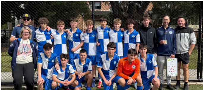
Under 16 Division 1