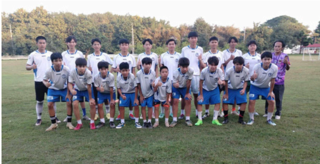
The senior boys soccer team, Loei province.