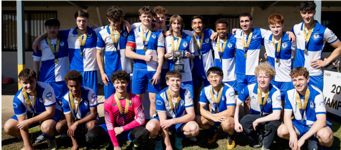
Under 18 Division 1