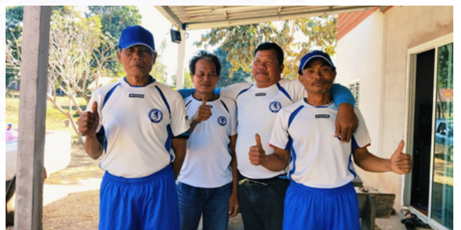
A few members of the Baan Nong Kwan village soccer team in Chayaphum province. A village of 25 houses. Our sister in law lives here. These blokes work hard in rubber plantations and pineapple fields, and are really fit!