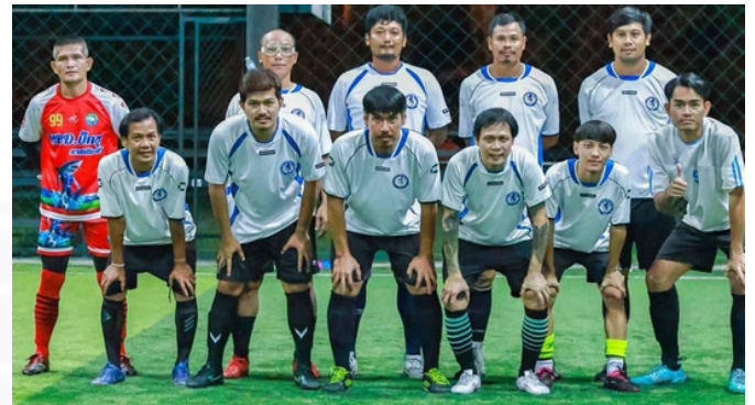
A Police charity match team in Chonburi.

In 2025 Hurlo was introducing the permanent kit change, and we approached the club to see if we could