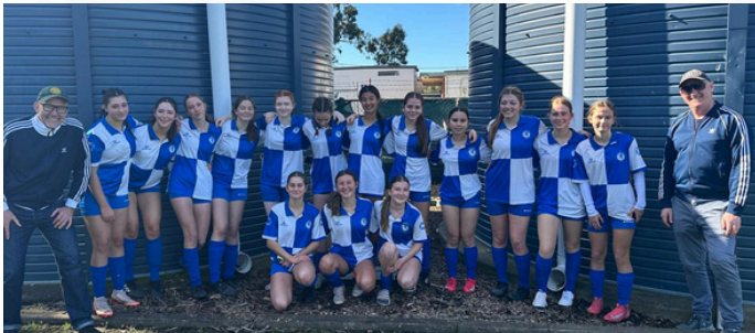
Under 16 Girls Division 2