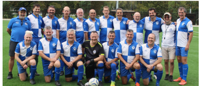
Over 50 Division 2