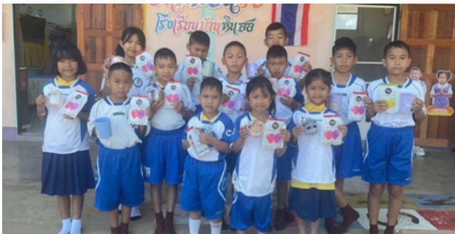
Junior students at Baan Hin Saw primary school with their sports prizes.