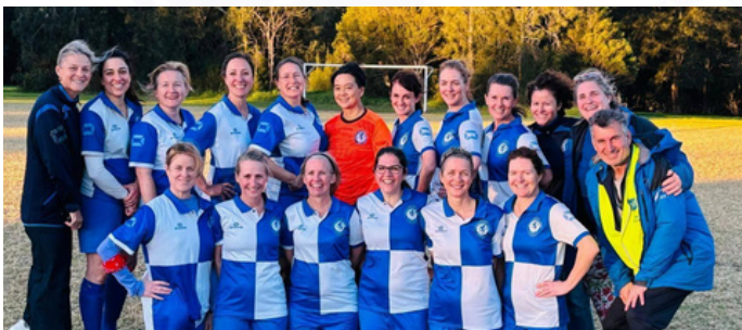
Over 35 Women Division 2A