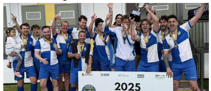
All Age Male Division 7

We acknowledge the traditional custodians of the lands on which we meet, train and play