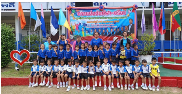
Students at Baan Lak Roi primary school dressed for their sports carnival.