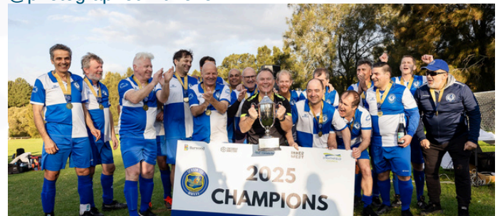
Over 50 Division 2