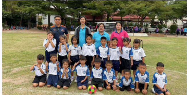
The junior mixed soccer team , Kalasin province.