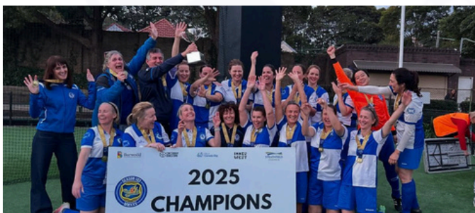
Over 35 Women Division 2A