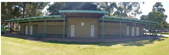
Ewen Park amenities building

If you have skills that would be useful for applying for funding, or other parts of the amenities developments please get in touch.